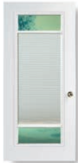
RLS 2064 / 2264