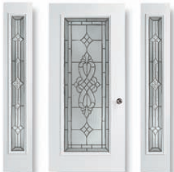
Door WSR-P 2264/2064 Sidelight WSR-P 0764 Transom WSR-P Rectangle