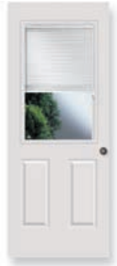
RLB 2036 1L RLB 2236 1L