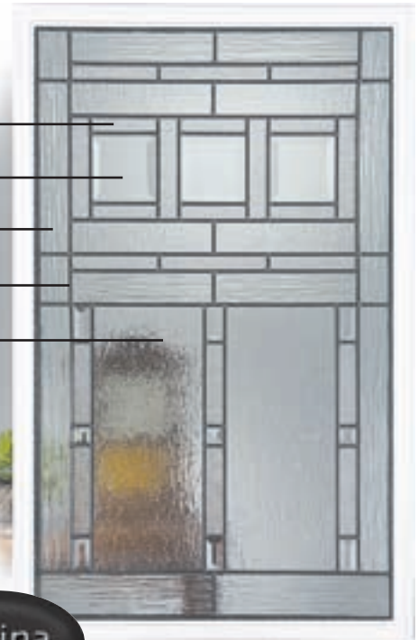
Double Granite Clear Bevel Cotswald Patina Caming Eaton