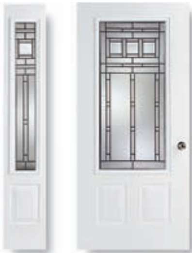
Door CFT-P 2248 Sidelight CFT-P 0848