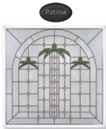
Oasis OAS-P 4848