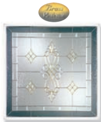
Windsor Sensations WSR-BPL 4848