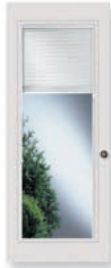
RLB 2064 1L RLB 2264 1L

Fully raise and lower blind for an open view or privacy.