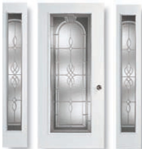
Door FON-SN 2264 Sidelight FON-SN 0764 Transom FON-SN Rectangle