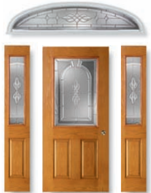
Door FON-SN 2236 Sidelight FON-SN 0836 Transom FON-SN Ellipse