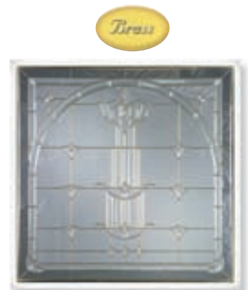
Royal Fountain FTN-B 4848