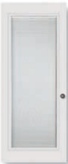
IGB 2264 1L IGB 2064 1L