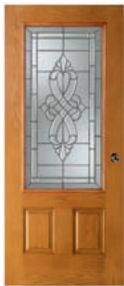
Door WSR-P 2248 Sidelight WSR-P 0848