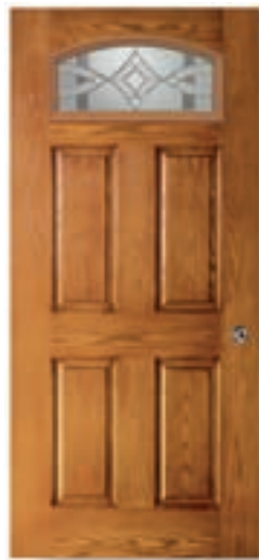
AUR-PL 2210 AT