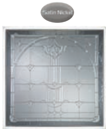
Royal Fountain FTN-SN 4848