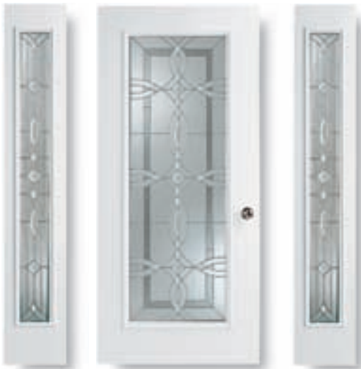
Door AUR-PL 2264 Sidelight AUR-PL 0764