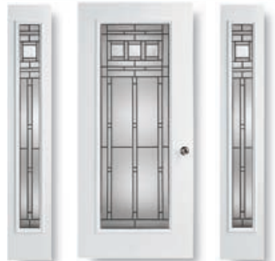
Door CFT-P 2264 Sidelight CFT-P 0764 Transom CFT-P Rectangle