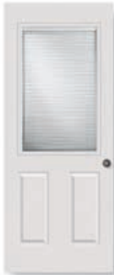
IGB 2236 1L