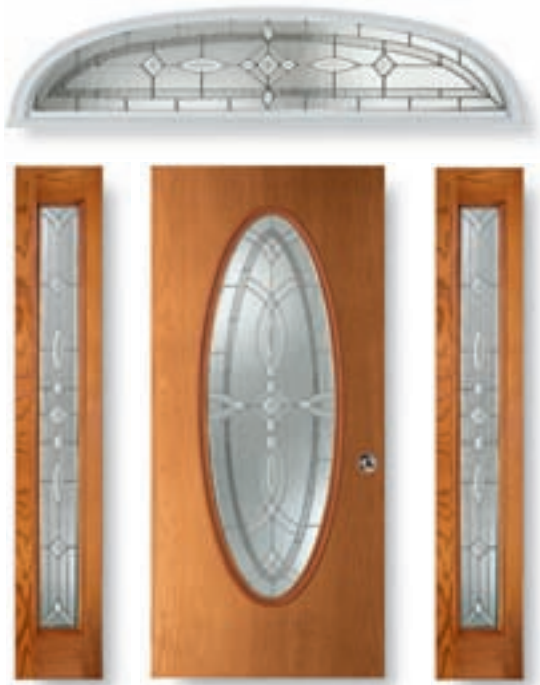
Door AUR-PL 919 Sidelight AUR-PL 0764 Transom AUR-PL Ellipse

The Aurora is an elegant weave of granite glass and bevels accented by an inner border of gray soft wave glass.