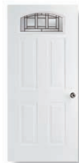
CFT-P 2210 AT