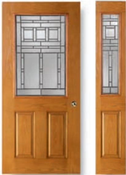
Door CFT-P 2236 Sidelight CFT-P 0836

The Vintage Craftsman design is reminiscent of the original Craftsman style with modern appeal. Featuring the obscure glass textures of eaton and double granite with a border of cotswald glass.