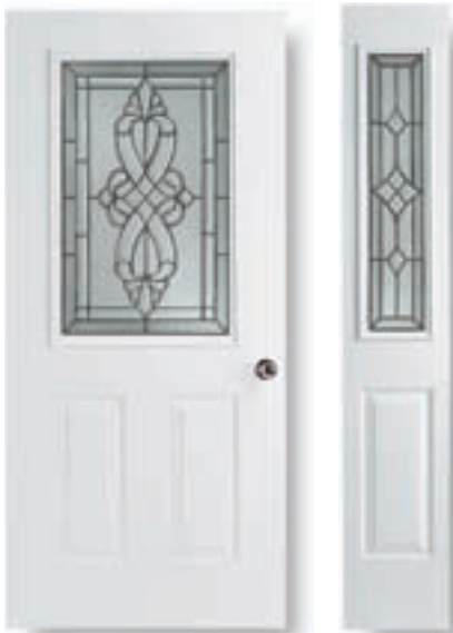
Door WSR-P 2236 Sidelight WSR-P 0836