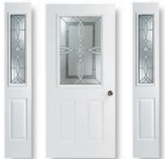
Door AUR-PL 2236 Sidelight AUR-PL 0836 Transom AUR-PL Rectangle