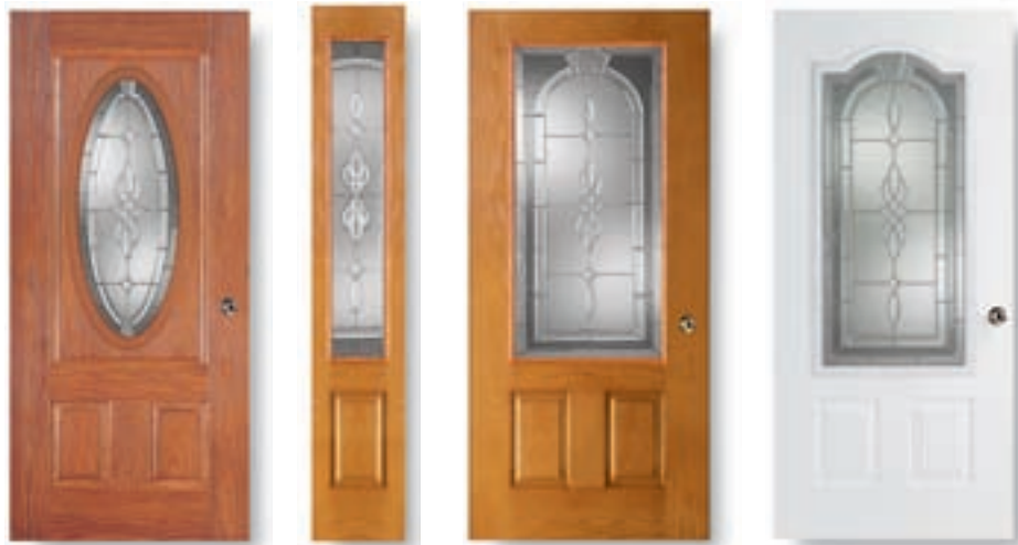
FON-SN 949 FON-SN 0848 FON-SN 2248 FON-SN 2248 ST

Glass inserts are available for 8 foot doors (80" glass) on a Special Order basis.