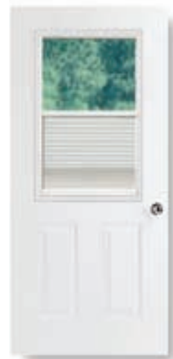
RLS 2036 / 2236